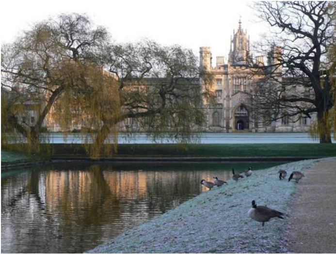
The River Cam and Trinity College