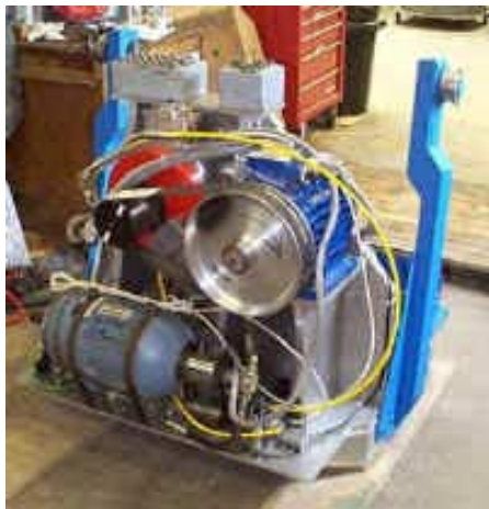
Fig.1 An overview of the Stored Angular Momentum (SAM) Earthquake Actuator

Use of geotechnical centrifuges to investigate the behaviour of geotechnical structures under earthquake loading has become very popular in recent years. There are already many established research centres worldwide with more joining this fraternity. In this paper we describe the development of a Stored Angular Momentum (SAM) based earthquake actuator at Cambridge for use on geotechnical centrifuges. An overview of the SAM earthquake actuator and model container is presented in Figs.1 and 2. While the SAM actuator has been working since 1995, certain key developments have been achieved which enhanced both the operational ease of this actuator and the quality of the earthquake loading. These developments will be highlighted in this paper.