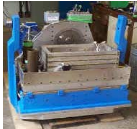
Fig.2 Self-contained swinging platform carries both the SAM actuator and the ESB soil model container

One of the challenging aspects of dynamic centrifuge modelling is the simulation of the semi-infinite extent of the prototype ground. Many concepts are in use to minimise the boundary effects for example a Duxseal layer at the end to form an absorbing boundary or the use of laminar boxes with very low horizontal stiffness or Equivalent Shear Beam (ESB) model containers which aim to mimic the dynamic stiffness of the soil during earthquake loading. The concept of ESB model containers proposed by Zeng and Schofield (1996) has been adopted for container design at Cambridge. A new deep ESB model container has been recently been developed at Cambridge that can simulate soil layers with a depth of 40m. An overview of this model container is presented in Fig.3. Recent work by Steedman (1999) has raised interesting issues about liquefaction of soil at the high confining pressures that can be encountered below very high dams. It is anticipated that this new model container will be able to address this topic of liquefaction of soil under high confining pressures.