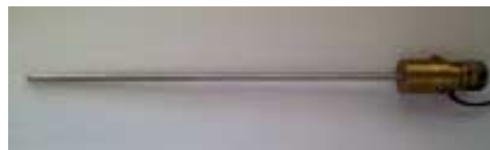
Fig.5 A view of the cone penetrometer probe

Three examples of the use of the SAM earthquake actuator and the ESB model container will be presented in this paper. The first example will be on modelling of liquefaction induced lateral flow of soils. The experimental results will be used to understand the development of excess pore pressures during the earthquake loading including the large suctions that will be generated during part of the acceleration cycle. The generation of the positive excess pore pressures and the suction 'spikes' will cause the soil slope to suffer a stick-slip type motion during the earthquake. Once the earthquake stops the soil will flow freely until it regains the necessary shear strength owing to the dissipation of excess pore water pressures.