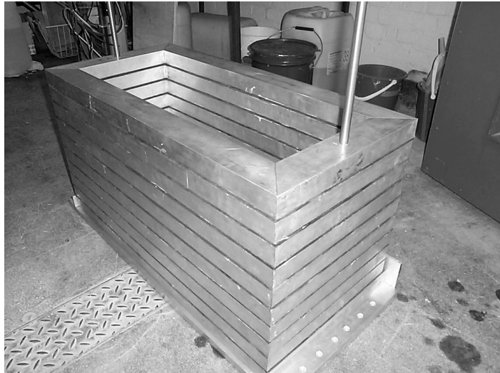
Fig.3 A view of the new large Equivalent Shear Beam (ESB) model container

Extensive work has been carried out to study the performance of the ESB model containers during dynamic centrifuge tests. Special in-flight cone penetrometers have been developed to compare the penetration resistance before and after earthquake loading and to quantify the boundary effects. A view of the in-flight CPT's is presented in Fig.4 and a view of the penetrometer probe is presented in Fig.5. The development of these cone penetrometers will be presented in this paper along with salient results.